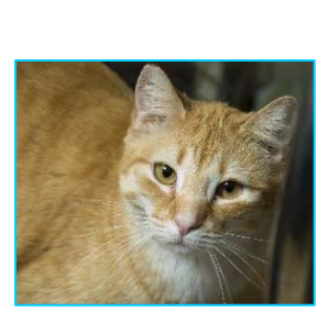
Kirby is an orange tabby